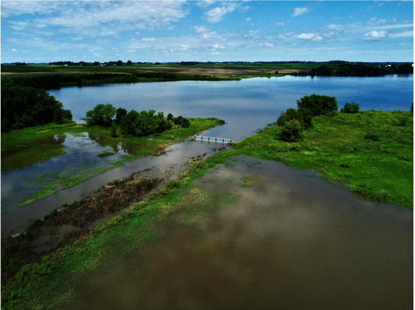
June Flooding at Lake Ocheda Dam

OKABENA-CHEDA WATERSHED DISTRICT 960 Diagonal Road, P.O. Box 114 Worthington, MN 56187-0114 (507) 372-8228 http://www.okabenaokedawd.org